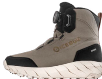
Alne BUGrip® Timber F0390002