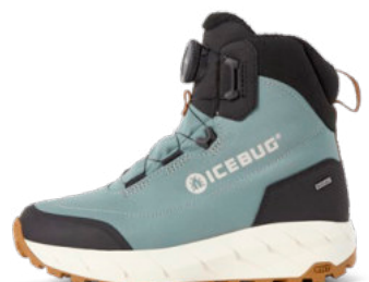
Alne NT™ LaurelGreen F0406005