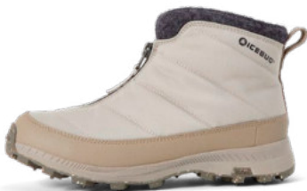
Sala BUGrip® TaupeGrey