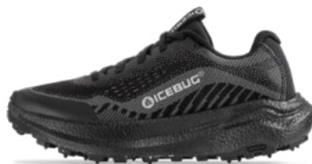
Myr BUGrip® Black M: F0380003 W: F0397002