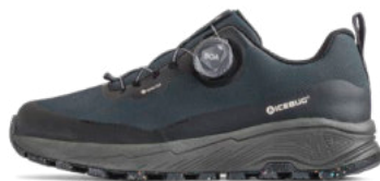
Haze RB9X™ GTX Black/Granite M: G93009-0F W: G93010-0F