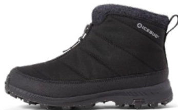
Sala BUGrip® Extra Wide Black M: F0467001 W: F0489001