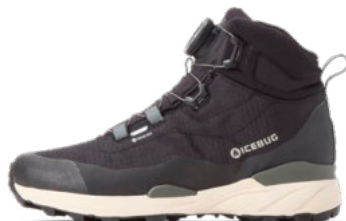
Rover 2 Mid RB9X™ GTX Black M: F0332001 W: F0398001