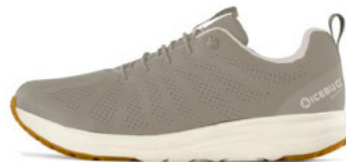
Mosi RB9X™ GTX Laure1Oak F0323005