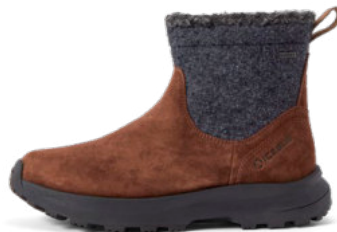
Sander NT™ Pinecone F0501002