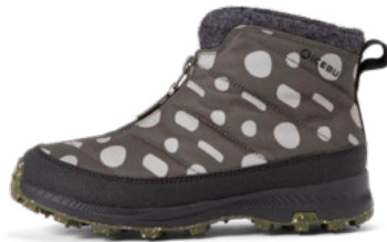
Sala BUGrip® Beluga/DoveGrey