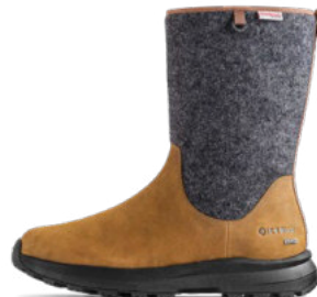
Grove 2 ReWool NT™ Coffee/Grey F0400002