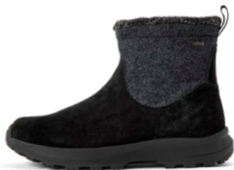
Sander NT™ Black F0501001