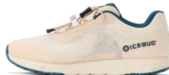
Kaipa RB9X™ Birch/Navy F0415002