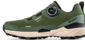
Rover 2 RB9X™ GTX LightMoss/Black M: F0315003 W: F0316003