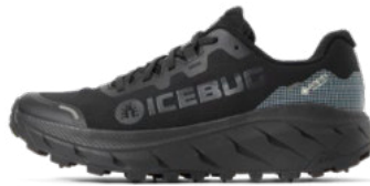
Arcus 2 BUGrip® GTX TrueBlack M: H70009-9A W: H70010-9A