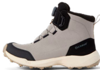
Norrvik BUGrip® TaupeGrey W: F0203004