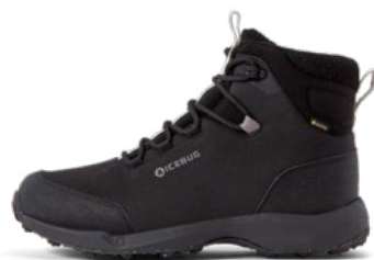
Pace 4 BUGrip® GTX Black BlackBlack BlackBlack