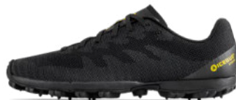
Spirit 9 OLX Black/Lemon M: F0326005 W: F0377002