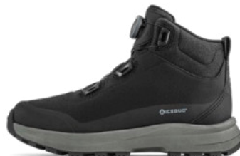
Stavre 2NT™ GTX Black/Granite M: F0437001 W: F0438001