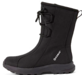
Cortina W NT™ Black F0502001