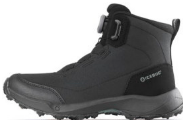
Norrvik BUGrip® Black M: F13100-9A W: F13101-9A