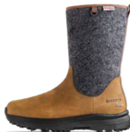
Grove 2 ReWool BUGrip® Coffee/Grey F0401002