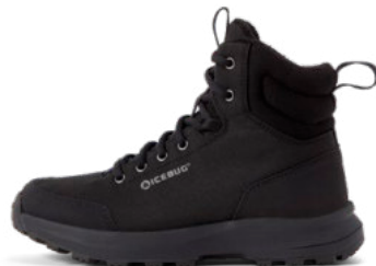
Nirak 3 NT™ Black F0498001