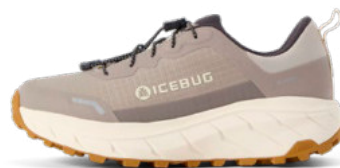
Hede NT™ TaupeGrey F0474001