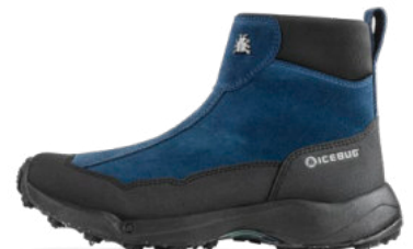
Metro2 BUGrip® DarkDenim W: F13004-9J