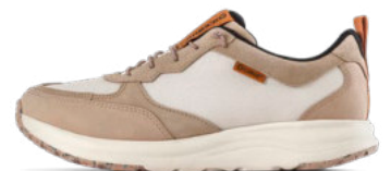
Norna RB9X™ Oat/Almond F0361005