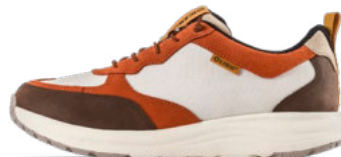
Norna RB9X™ Oat/Terracotta F0361004