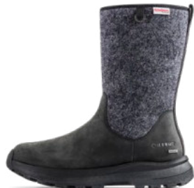
Grove 2 ReWool NT™ Black/Grey F0400001