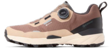
Rover 2 RB9X™ GTX Taupe M: F0315004 W: F0316005