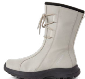
Cortina W NT™ TaupeGrey F0502002