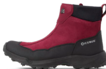
Metro2 BUGrip® Mulberry W: F13004-9B