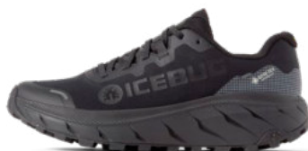
Arcus 2 RB9X™ GTX TrueBlack M: H73005-0A W: H73006-0A