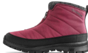
Sala NT™ Mulberry W: F0392003