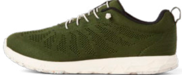
Eli RB9X™ Olive F88025-0E