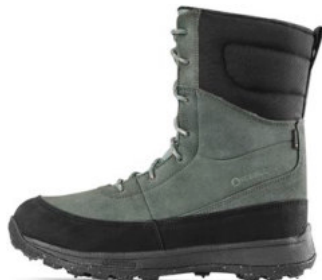
Torne 2 BUGrip® GTX PineGrey F0428001