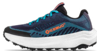
Myr BUGrip® MidnightBlue M: F0380002 W: F0397001