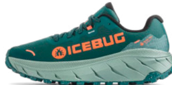
Arcus 2 RB9X™ GTX SeaMoss/Coral M: F0346003 W: F0347003