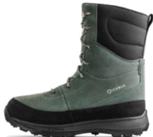
Tome 2 NT™ GTX PineGrey F0427001