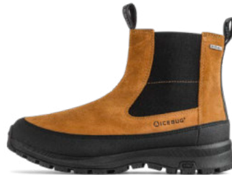
Boda NT™ Hazel M: F0431004 W: F0432005