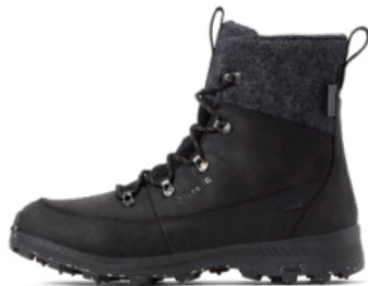
Adak ReWool BUGrip® Black/Grey F0429001