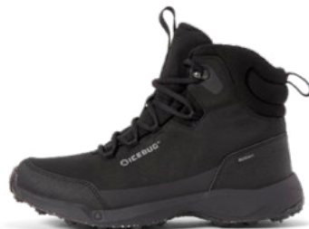
Muurame 5 BUGrip® Black F0455001