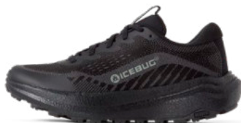
Myr RB9X™ Black M: F0410003 W: F0448001