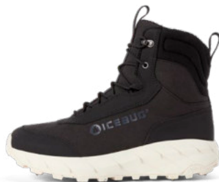
Moen BUGrip® Black F0457003