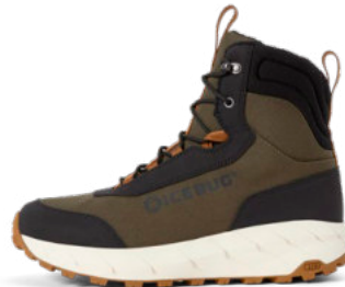
Moen NT™ Ink/Breen F0456001