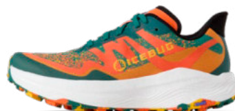
Järv RB9X™ Grapefruit/Green M: F0324008 W: F0378004