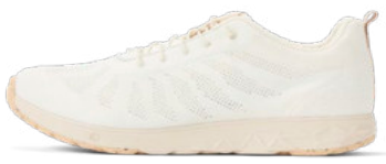
Eli RB9X™ CreamWhite F0235014