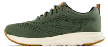
Mosi RB9X™ Sage F0317004