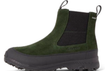
Boda BUGrip® ForestGreen W: F0276007