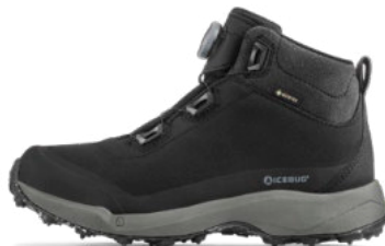
Stavre BUGrip® GTX Black/Granite M: F0180004 W: F0183004