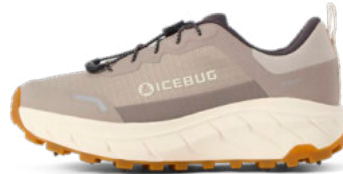
Hede BUGrip® TaupeGrey F0458001