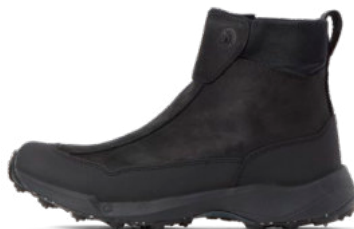
Metro 2 Nubuck BUGrip® Black M: F13104-9A W: F13105-9A