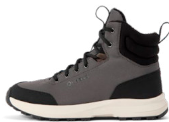
Nirak 3 NT™ Beluga F0498002