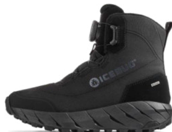
Alne NT™ Black F0406004