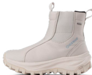
Valda NT™ Macadamia F0371003