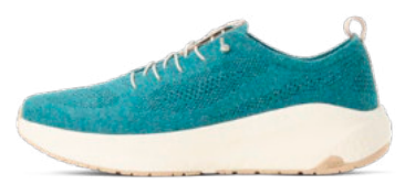
Aura ReWool RB9X™ MelangeBlue F0305008