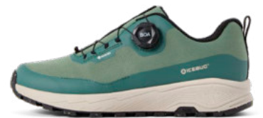
Haze RB9X™ GTX LaurelGreen M: F0263010 W: F0264013