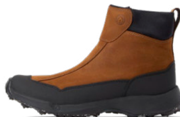
Metro 2 Nubuck BUGrip® Coffee M: F13104-9B W: F13105-9B