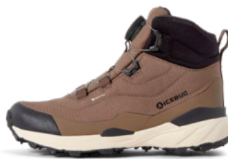
Rover 2 Mid BUGrip® GTX Cedarwood M: F0491002 W: F0492002