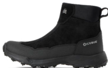
Metro2 BUGrip® Black M: F13003-9A W: F13004-9A