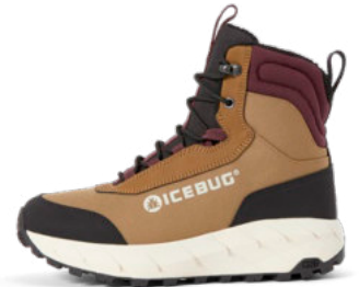
Moen NT™ Breen/DarkCherry F0456002