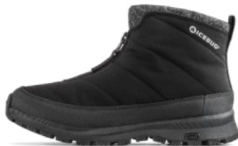
Sala NT™ Black M: F0393001 W: F0392001