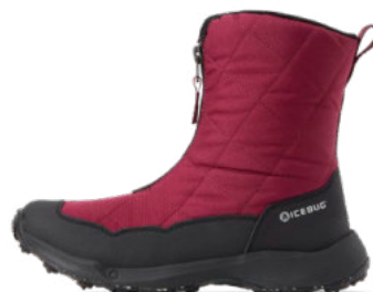
Ivalo4 BUGrip® Mulberry W: F13103-9B