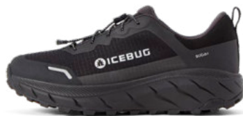
Hede NT™ Black F0474003