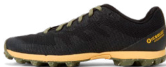
Acceleritas 9 RB9X™ Green/Lemon M: F0327003 W: F0376003