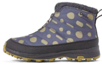
Sala BUGrip® GreyWhale/OliveDrab