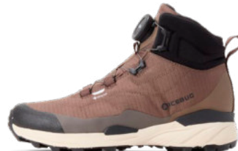
Rover 2 Mid RB9X™ GTX Cedarwood M: F0332002 W: F0398002