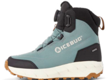
Alne BUGrip® LaurelGreen F0390006