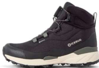
Rover 2 Mid BUGrip® GTX Black M: F0491001 W: F0492001