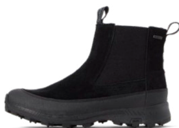
Boda BUGrip® Black M: H41015-9A W: H41016-9A