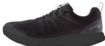
Mosi RB9X™ GTX TrueBlack F0323004