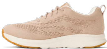
Mosi RB9X™ LightTaupe F0317007