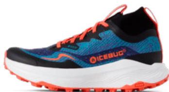
Järv Gaiter RB9X™ GTX IceBlue/Orange M: F0469001 W: F0470001