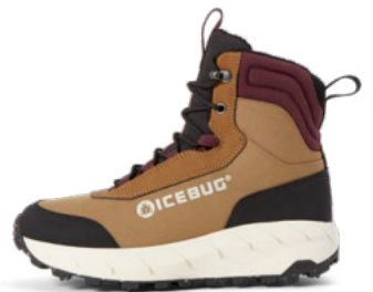
Moen BUGrip® Breen/DarkCherry F0457002