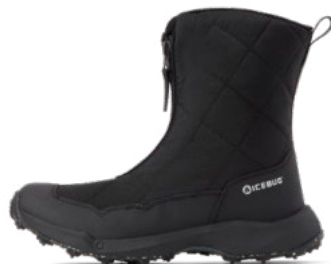
Ivalo4 BUGrip® Black M: F13102-9A W: F13103-9A