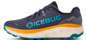
Arcus 2 BUGrip® GTX Inkling/Yam M: F0344004 W: F0345007