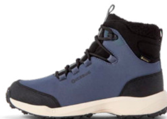
Pace 4 BUGrip® GTX GreyWhale F0454003