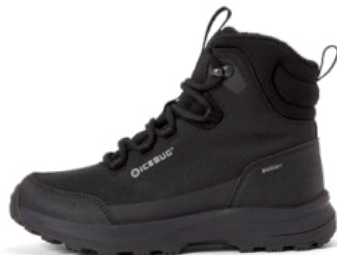
Murame 5 NT™ Black F0499001