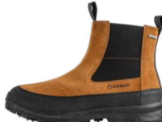
Boda BUGrip® Hazel M: H41015-9B W: H41016-9B