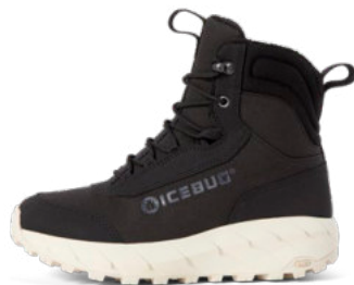
Moen NT™ Black F0456003