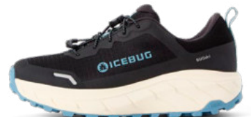
Hede NT™ Black/Citadel F0474002