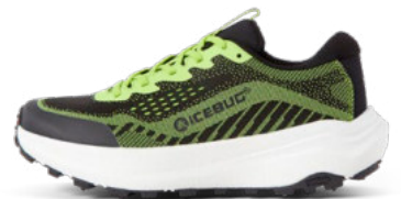
Myr BUGrip® Black/GreenGlow M: F0380004 W: F0397003