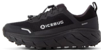
Hede BUGrip® Black F0458003