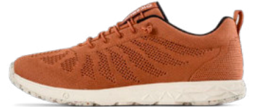
Eli RB9X™ Terracotta F0235010