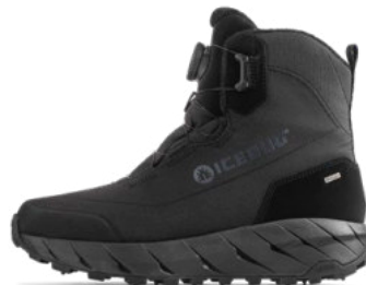
Alne BUGrip® Black F0390002