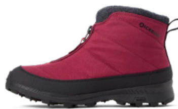
Sala BUGrip® Mulberry