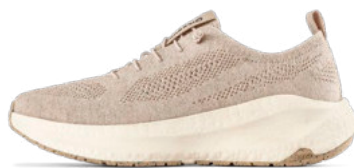
Aura ReWool RB9X™ MelangeSand F0305003