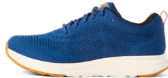
Mosi RB9X™ DenimBlue I54001-0C