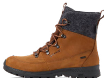
Adak ReWool NT™ Coffee/Grey F0430002