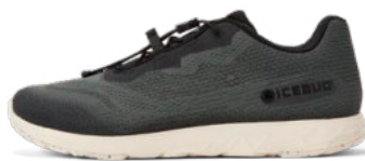
Kaipa RB9X™ Black/Rock F0415004