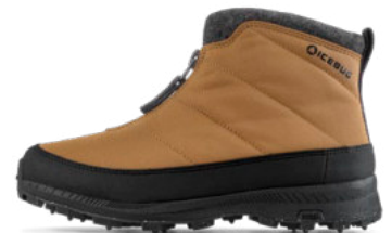
Sala BUGrip® Pecan