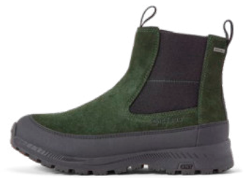
Boda NT™ ForestGreen W: F0432007