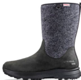
Grove 2 ReWool BUGrip® Black/Grey F0401001