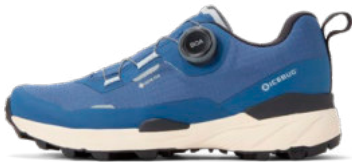
Rover 2 RB9X™ GTX Navy M: F0315005 W: F0316004