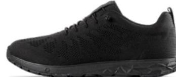
Eli RB9X™ TrueBlack F0235012