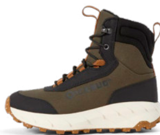
Moen BUGrip® Ink/Breen F0457001