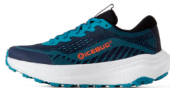
Myr RB9X™ Triple Blue M: F0410006 W: F0448004