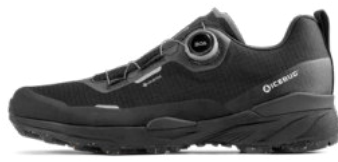
Rover 2 RB9X™ GTX Black/SlateGrey M: I53001-0A W: I53002-0A