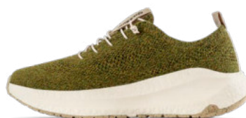
Aura ReWool RB9X™ MelangeMoss F0305004