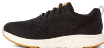
Mosi RB9X™ Black I54001-0A