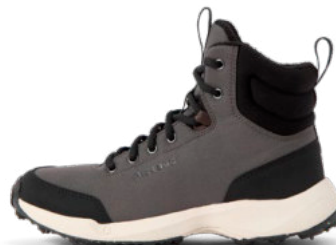
Nirak 3 BUGrip® Beluga F0452002