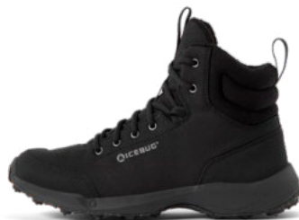
Nirak 3 BUGrip® Black F0452001