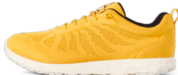
Eli RB9X™ Mustard F88025-0J