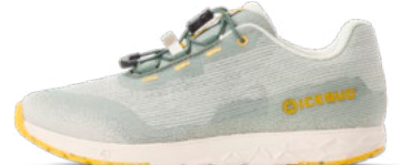
Kaipa RB9X™ LaurelGreen/LemonCurry F0415003