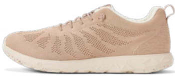
Eli RB9X™ LightTaupe F0235016