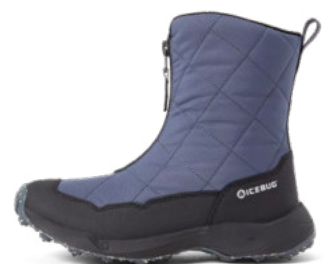
Ivalo4 BUGrip® GreyWhale W: F0205003