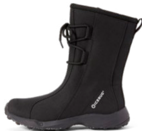
Cortina W BUGrip® Black F0493001