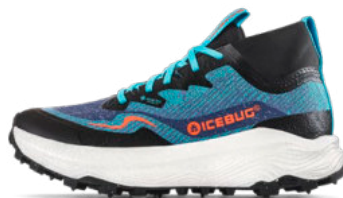
Järv Gaiter BUGrip® GTX IceBlue M: F0370001 W: F0395001