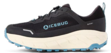
Hede BUGrip® Black/Citadel F0458002