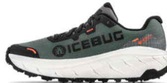
Arcus 2 BUGrip® GTX Grey M: F0344003 W: F0345003