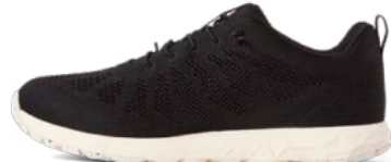
Eli RB9X™ Black F88025-0A