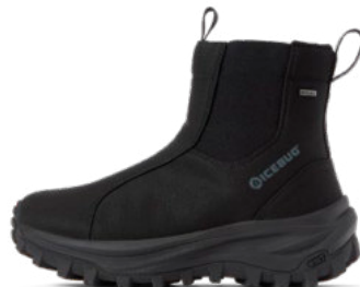
Valda NT™ Black F0371001