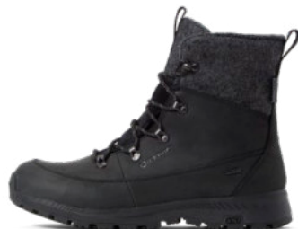
Adak ReWool NT™ Black/Grey F0430001