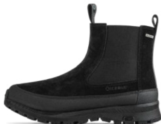
Boda NT™ Black M: F0431003 W: F0432004