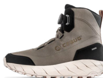
Alne NT™ Timber F0406002