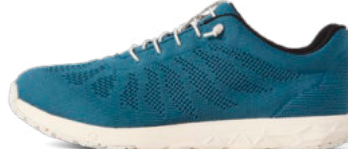
Eli RB9X™ Steel blue F88025-0B