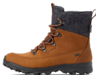
Adak ReWool BUGrip® Coffee/Grey F0429002