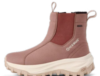
Valda NT™ Clove F0371006