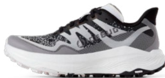
Järv RB9X™ Black/White M: F0324007 W: F0378003