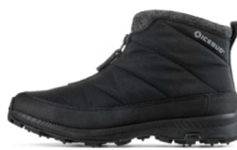
Sala BUGrip® Black M: H41017-9A W: H41018-9A