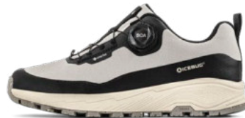
Haze RB9X™ GTX Clay M: F0263008 W: F0264009