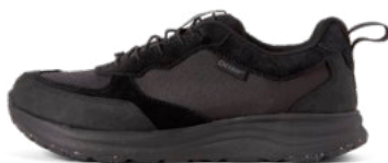
Norna RB9X™ TrueBlack F0361010